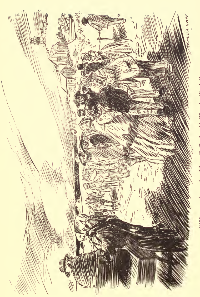
"'You can't go in, Mrs. Coffin,' said Thoph Black."